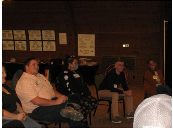
SO WHAT WERE YOUR THOUGHTS?