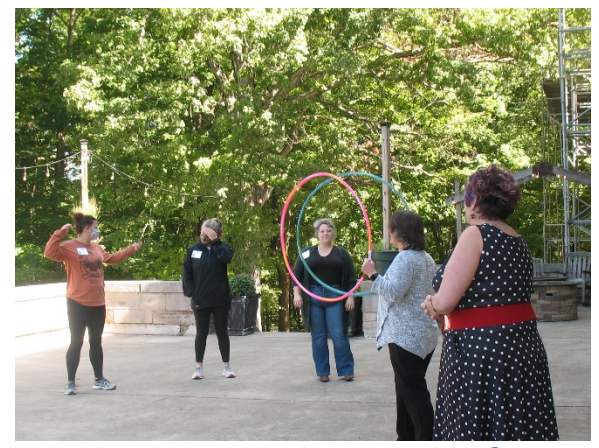
WHAT CAN WE LEARN FROM HULA HOOPS?