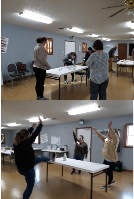
Celebrate your victories!