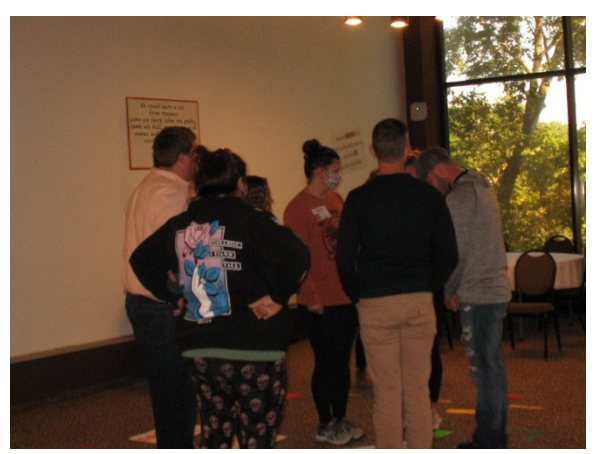
HOW COMFORTABLE ARE WE?

Class members discussed the positives they see in Washington County and the negatives. They talked about possible ways to make improvements in our community and acknowledged how important it was to commit and follow through with those ideas.